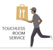
TOUCHLESS ROOM SERVICE

Physical distancing throughout all areas of the hotel including in public areas, fitness centers, meeting spaces, lobby, and work areas. Training associates on physical distancing in interactions with guests and with each other. Encouraging guest use of touchless delivery of services from check-in, keyless room access, to ordering room service wherever available.